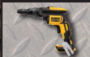
20V MAX* XR® VERSA-CLUTCH™ Adjustable Torque Screwgun (Tool only)