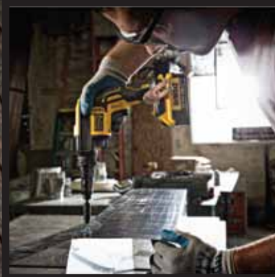
METAL TO METAL FASTENING