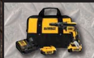
20V MAX* XR® VERSA-CLUTCH™ Adjustable Torque Screwgun Kit (4.0Ah)