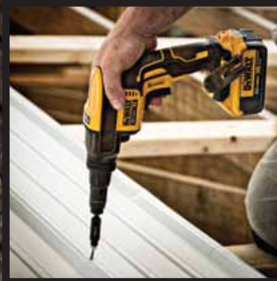
METAL TO WOOD FASTENING (POST FRAME BUILDING)